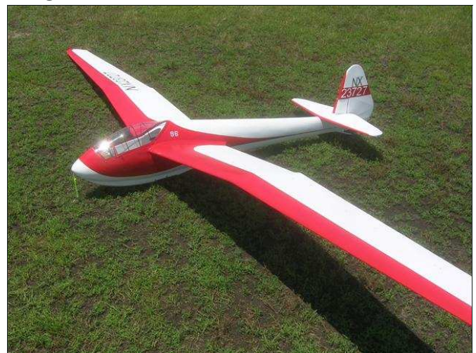
An Orlik 2:

For those of you who have never attended the JR Aero Tow, I would recommend you clear your calendar for the first weekend in June and don't forget your sunscreen!