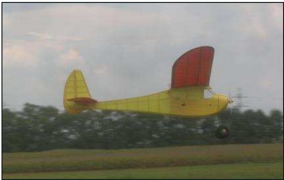
(Above) Devin's classic Viking has a lifting stab, ultra-low weight Micafilm covering, balloon tires (no ground looping here!), and flew effortlessly. It gave one members' glider a run for its' money with power off.