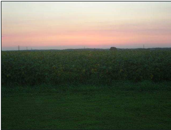
And another great flying day at the field draws to a beautiful close....