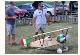
From the large and modern to the small and historical, we fly them all.