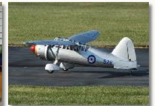
A classic aircraft taking off.