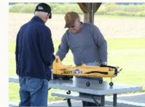
Getting a WWII airplane ready for flight

Youth Membership $20 (19 years old and under)