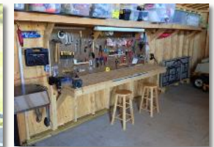
Our field workbench with tools and supplies and we have a generator powered station.