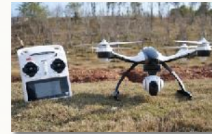
Club members enjoying flying multi-rotor aircraft at the field.

Order food at 6pm (optional) Meeting at 7:00pm, check our web site for indoor meeting location.