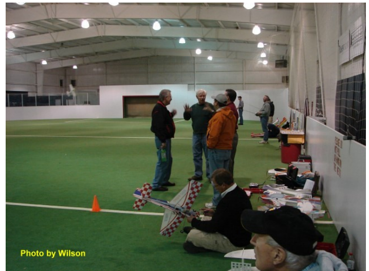
Friday Night Electric-Fly Crew