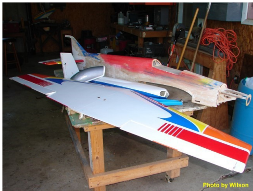
The China "Icepoint"