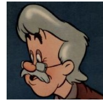
What do you think?