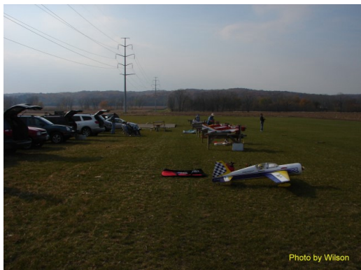
A photo of the new field, looking west.

November 1 st was a big day at the new field. The weather was unusually nice and 13 flyers showed up to try out the “new digs”.