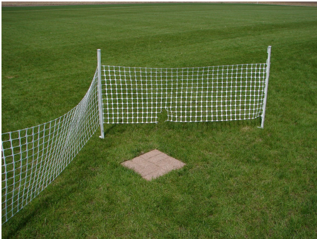
"The Hoelscher Hole"

Instead of shutting off, the engine went to full power and, luckily, crashed into the pilot barrier. Before chewing itself to a stop, the propeller ate a hole in the barrier. This was subsequently photographed for posterity and dubbed "The Hoelscher Hole". A reminder to NEVER shut your transmitter off while the engine is running.