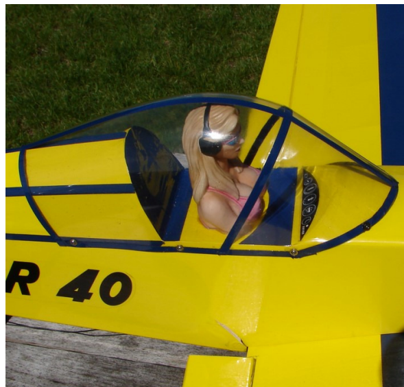
Notice the nice headphones on this pilot.