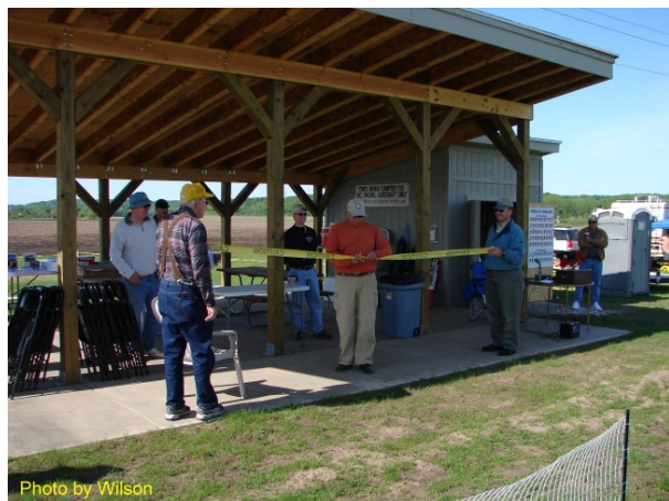
Cutting the ribbon.