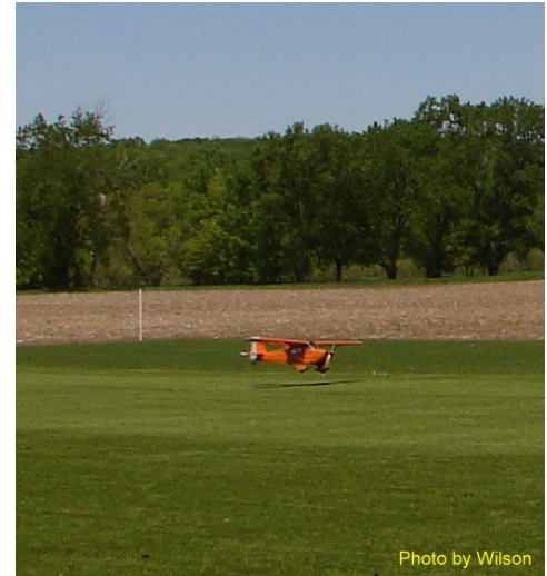
George Knight's Super -D on landing.