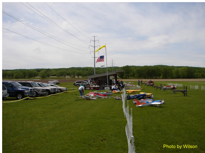
PRCM Open House 2009