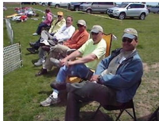
Some guys in need of a "Wanted" poster.

Well, the Grand Opening went off very nicely on Sunday, May 17 th . I think all had a good time with Mother Nature taking a day off from The wet and wind for beautiful flying weather.