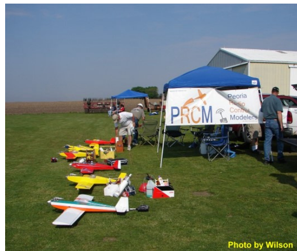
PRCM Racing Team Headquarters @ Bloomington SIRS