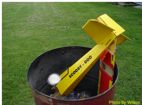
A final photo of Bob Wilson's "Scooby-Doo" before cremation. The view of the pilot was obscured at the request of next of kin.

That grand old pylon racer, "Scooby-Doo" was on the way to yet another winning day when violently and maliciously attacked and destroyed in the third round at race 1. The collision occurred at the left pylon when "Scooby" was pulling maximum "G's". The airplane disintegrated in the air.