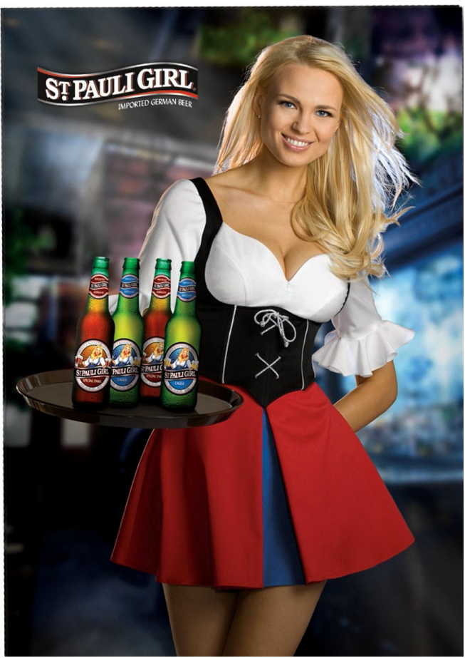
One beer for the St Pauli girl and three for me...what could be better?