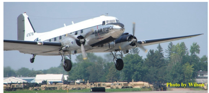
DC-3/C47's were the theme for Airventure 2010.