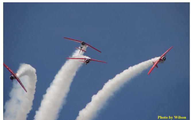
One of my favorite shots, the Aeroshell AT6's doing their thing.