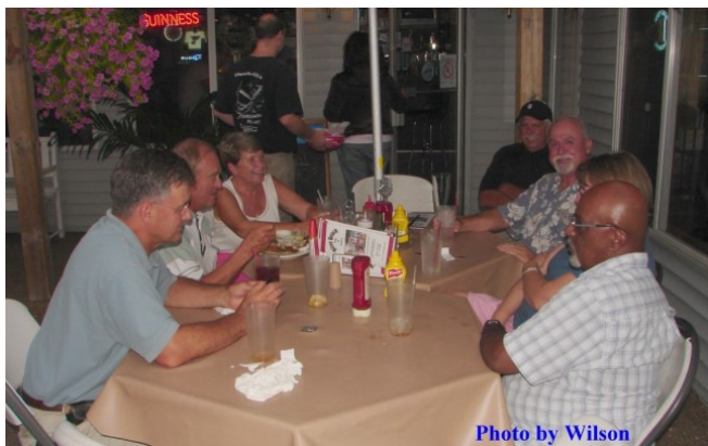
The Friday night pre-pattern get together at the River Beach Pub.

The Peoria RC Modelers worked very hard in preparation for this event and the field looked great. Center poles and box markers were in place and the field was striped with high visibility athletic lime.