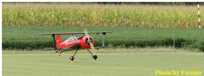
A great action shot of "The Beast"