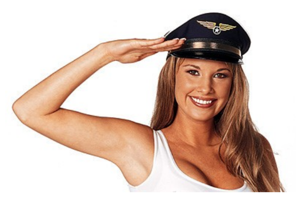
See you next month!