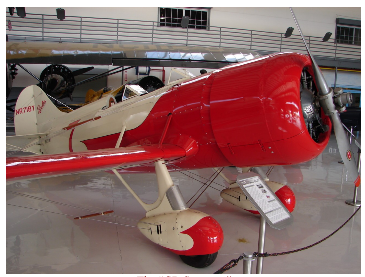
The "GB Sportster"

This should be an interesting presentation. Please plan to attend