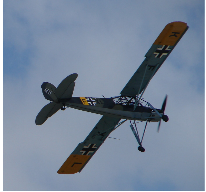
Fieseler Fi-156 Storch

The editor took this photo of a full scale Fieseler Storch while visiting Kermit Week's "Fantasy of Flight" museum in Polk City, Florida. As part of the program they roll out one of the display airplanes every day at 1:30 and fly it for the crowd. On this day they demonstrated the STOL capabilities of the Storch. It hopped off the ground in about 30 feet!