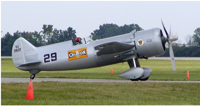
Laird Turner-14 "Meteor" (replica) at Oshkosh 2003.