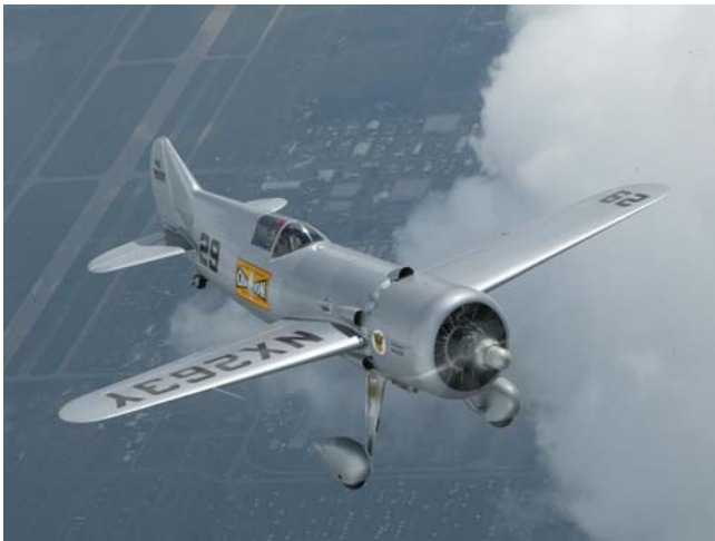
Laird Turner Meteor in flight.