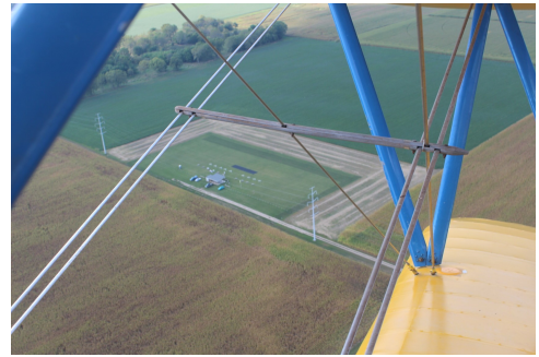
Overhead view of the PRCM field from the Stearman Bipe.