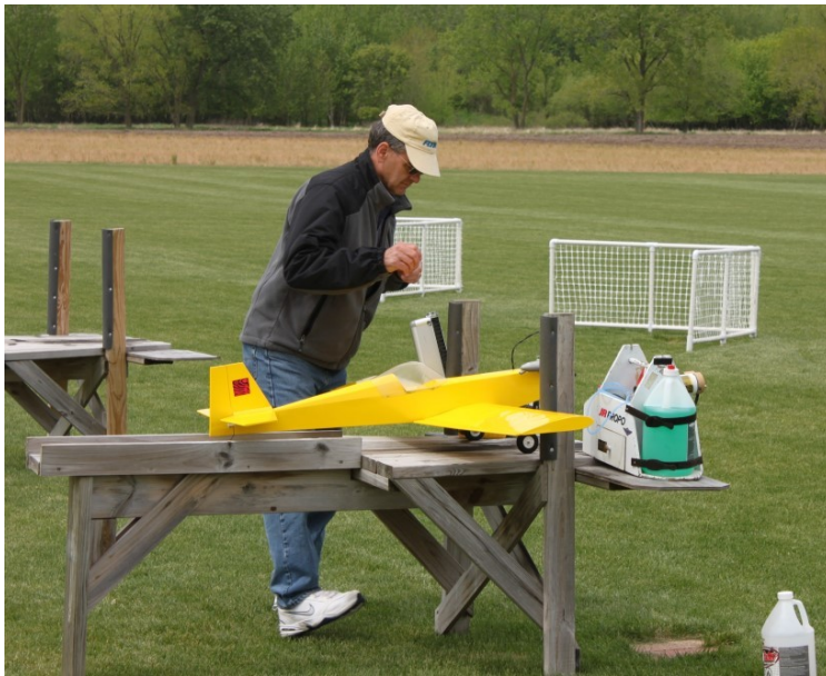
Making final adjustments to "Ole Yeller"