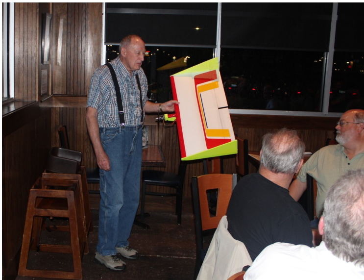
Verne's new design