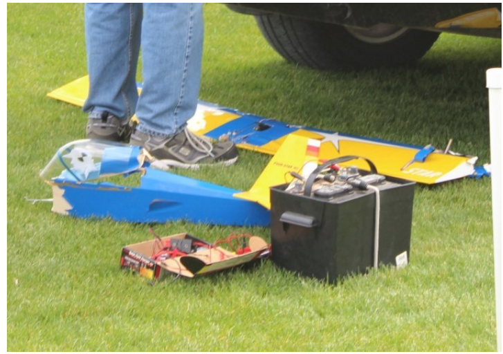
Always check your ailerons