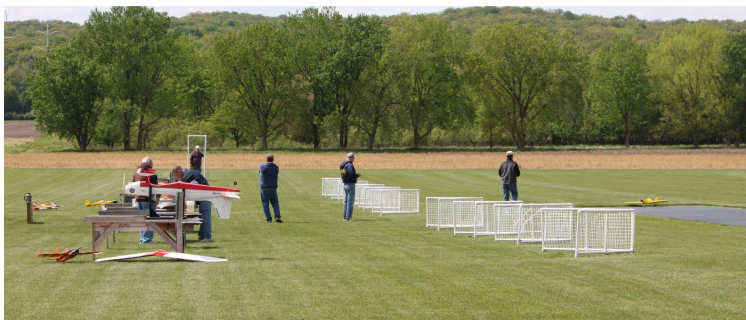
The first 2012 Speed Challenge day at the field.

I am absolutely, positively going to have to start out talking about the upcoming racing season. The last month has seen a large number of Four-Stars out getting in practice laps. That blue and gold one looks really quick and I think he may even be sand-bagging a bit. Saturday, April 21 st saw the season opening runs of the Four-Star Speed Challenge.