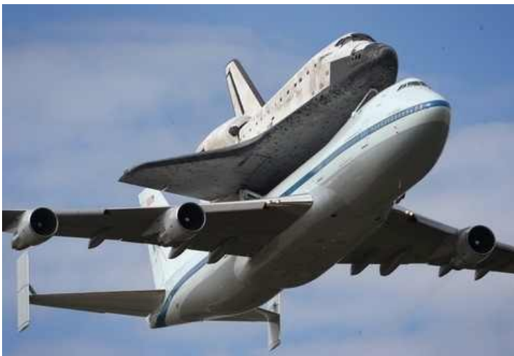
The last of an era