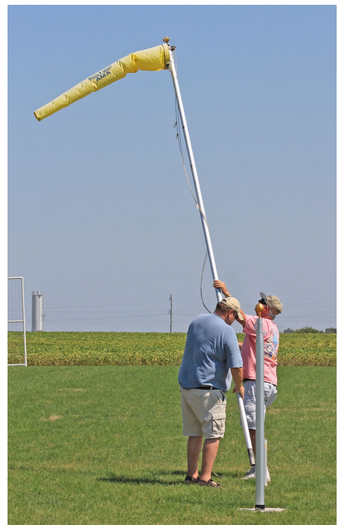
Not exactly Mt. Surabachi, but these guys got the job done.