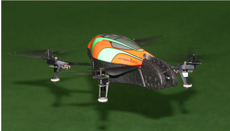
Jim Fassino's...ah...strange aircraft... at last year's indoor flying

We have tried open flying and we have tried reserving time periods for micro flyers and helicopters. We have also tried pylon and on occasion combat. If you have ideas about increasing the fun make your thoughts known. Better yet why not volunteer to organize the event. And speaking of volunteers, we need PRCM members to sign-up to open and close the complex each Friday night.