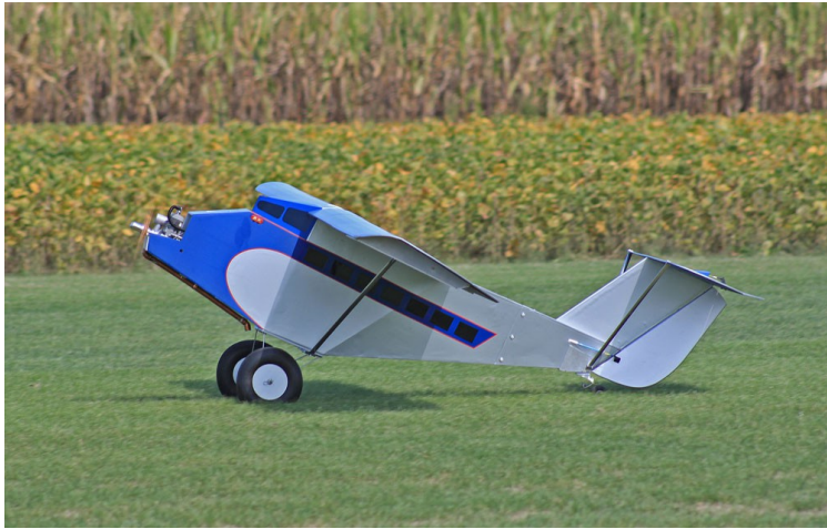
Try as it may, Steve Blessin's Super Big "Mud Duck" never got off the ground at the Family Day picnic.