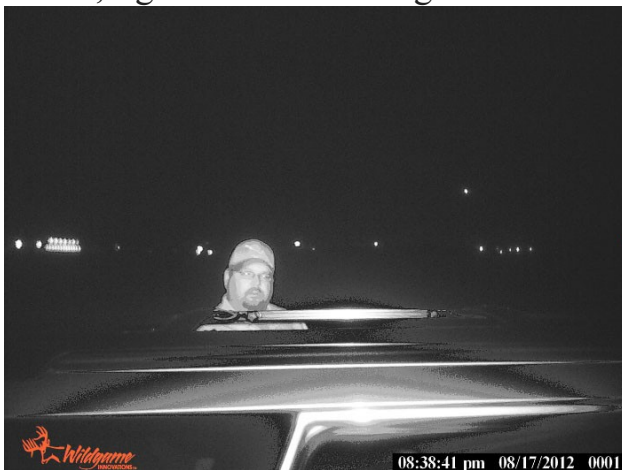
Name that ghost!

Finally, I think I may have solved a mystery that has been bothering me this year. There have been one or two evenings where I have had the field to myself to enjoy a quiet flight or two on the way home. On at least one of these instances, I got the eerie feeling that I was