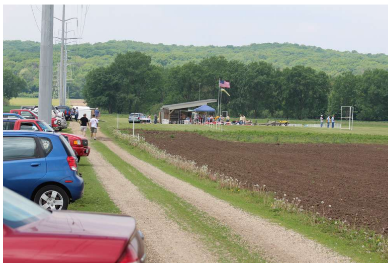
The view looking west. This open house was very well attended.