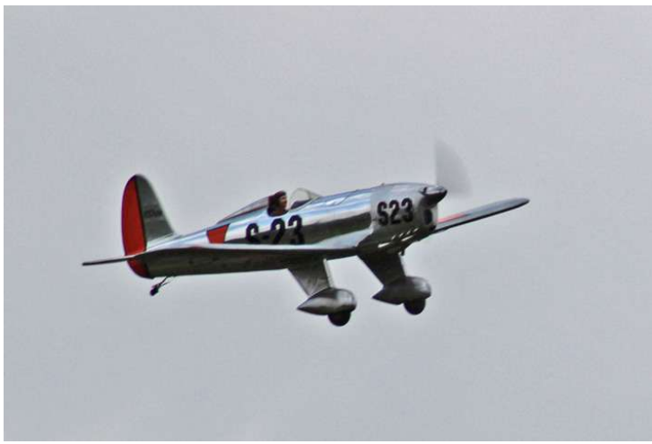
You have to love the Ryan ST.