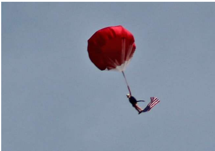
The entertainment team of Dewey-Hogan put together a parachute drop during the playing of the National Anthem.