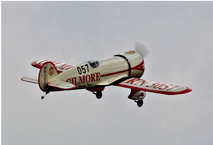
We had some great Golden Era Racers