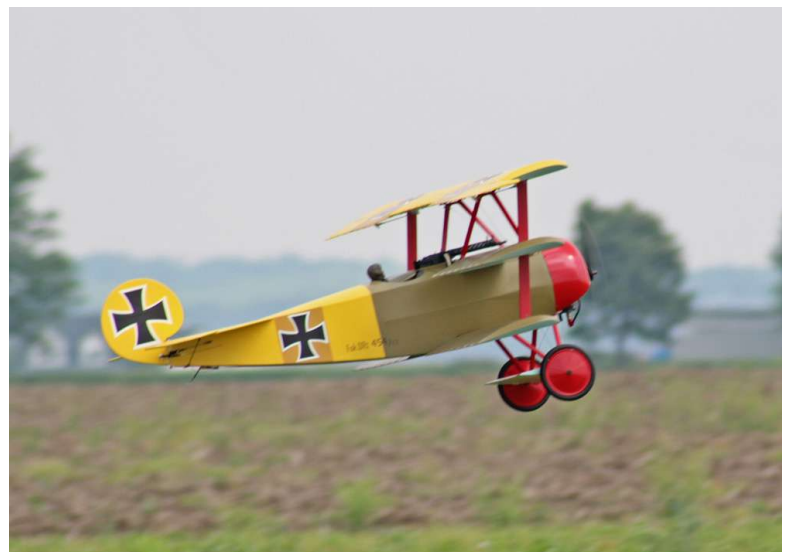
The Red Baron was represented.