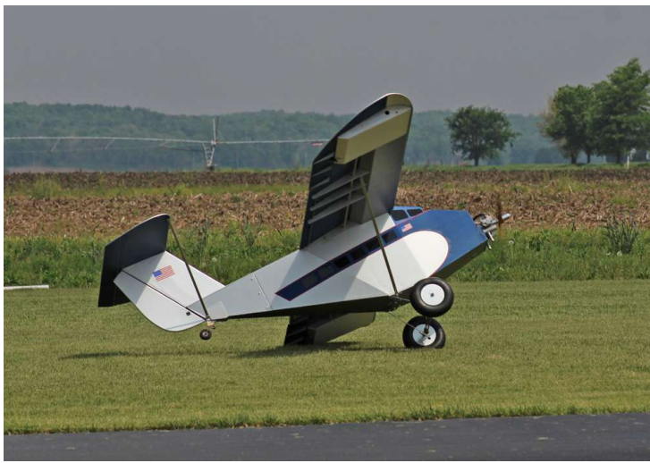
Although I missed the one and only (brief) flight of the “Mud Duck,” I did get an earlier shot of it “break dancing” across our field.