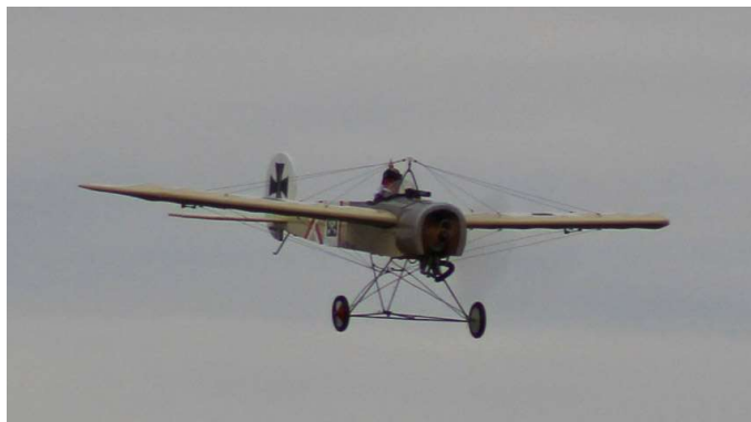
It really did look good in the air.

back to the pits. Jon held his creation and with a smile only a fellow RC modeler could fully appreciate while the cameras captured the moment. Another great picture was taken by Bob Wilson that captured the Eindecker in flight. You have to look closely to see that it is not a full scale airplane but rather a model.