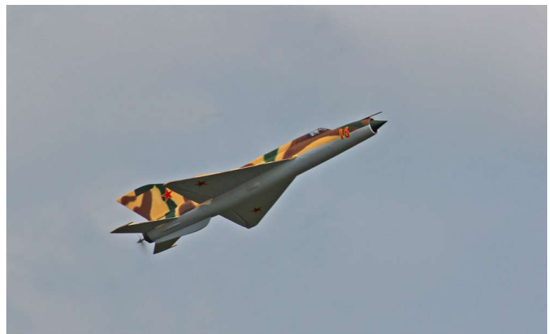
A cool looking MIG.