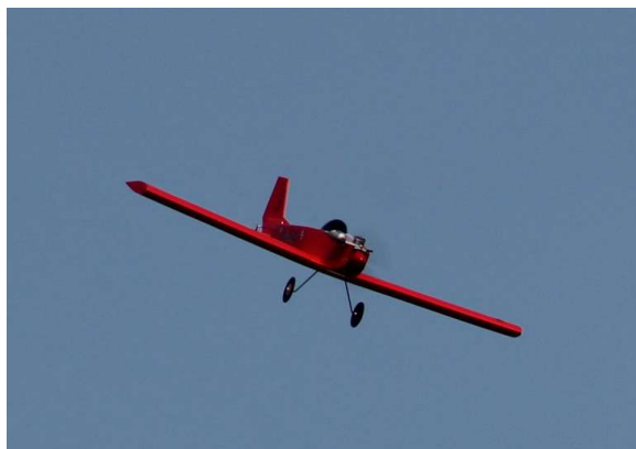
Joe Board's Sky Raider blasting toward the start line.

Board blasted a super start and flew a tight race. Stegall was inhaling fumes the whole race while Ferg never got off the launch pad.