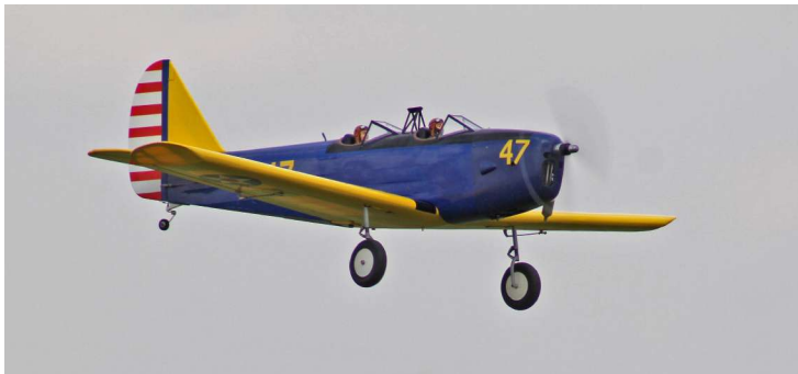
This gorgeous PT-19 flew at the Open House