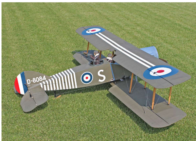
We had some great looking warbirds