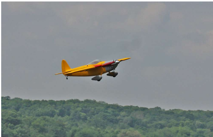
Another racer. This one we lovingly call "Swamp Thing".