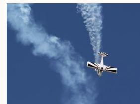
A gas powered airplane with smoke on