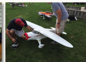
A large aircraft gets ready for flight.