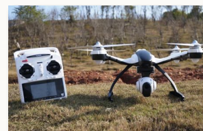
Club members enjoying flying multi-rotor aircraft at the field.