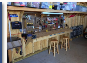
Our field workbench with tools and supplies and we have a generator powered station.