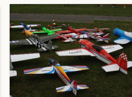
From the large and modern to the small and historical, we fly them all.